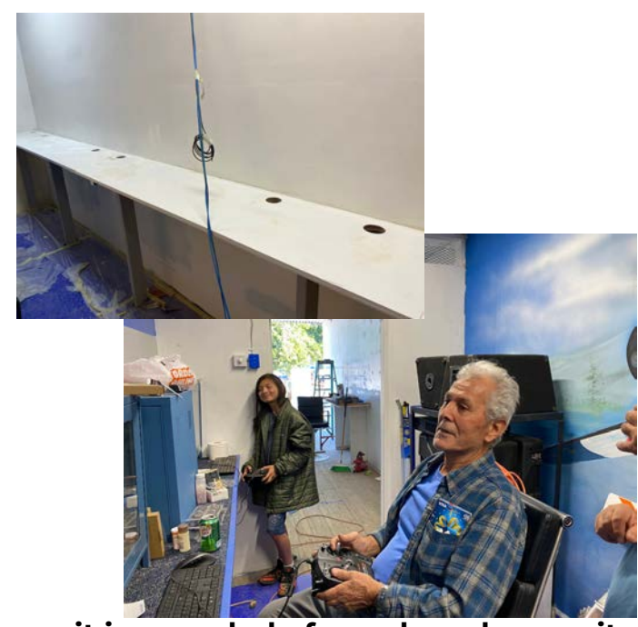
Our training center is not just a physical space; it is a symbol of our shared commitment to overcome challenges and emerge stronger than ever.