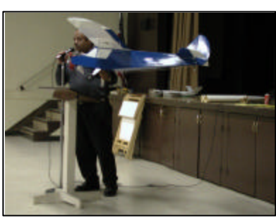
Bob Smith-Woody Woodward's Cruisair 800 with O.S. .91 four stroke.