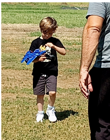
Ford was having a hard time