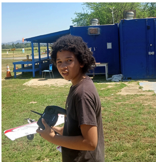
this young man lives 6 months in Northern Cali and 6 months in an African Rainforest. His father is a holistic doctor there.