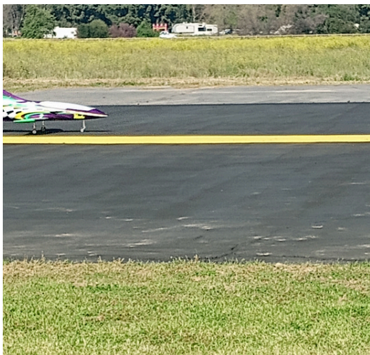
Smooth Landing, Nice Runway!!!