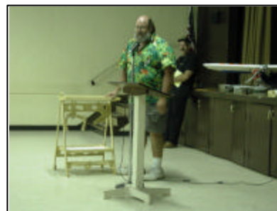
Ricc Bieber-Custom finished Field Table.