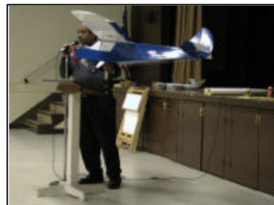
Bob Smith-Woody Woodward's Cruisair 800 with O.S. .91 four stroke.