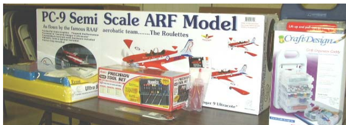
A View of October's raffle loot!