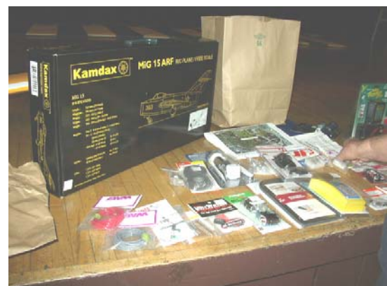
Some of the many new and unusual model tools and toys that Jay brought for his presentation