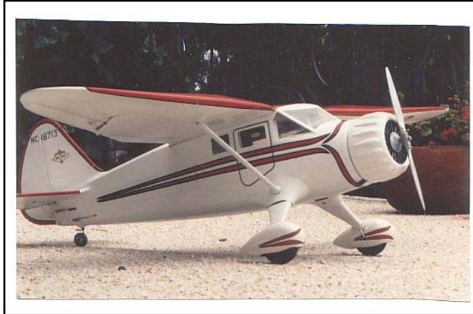
This one is so nice, it made the front page as well