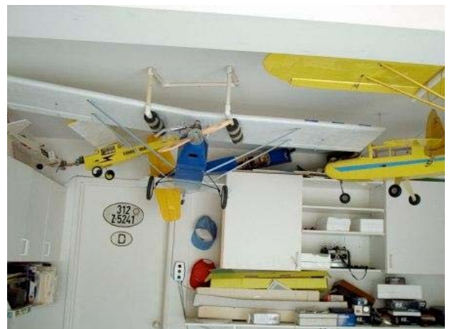
And still more planes...