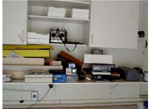
Various Pieces and Parts