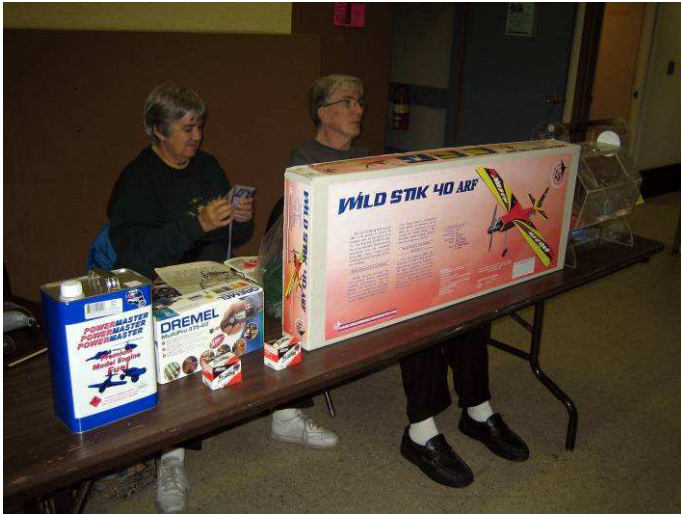
Figure 1 Some of the neat stuff YOU could have won.