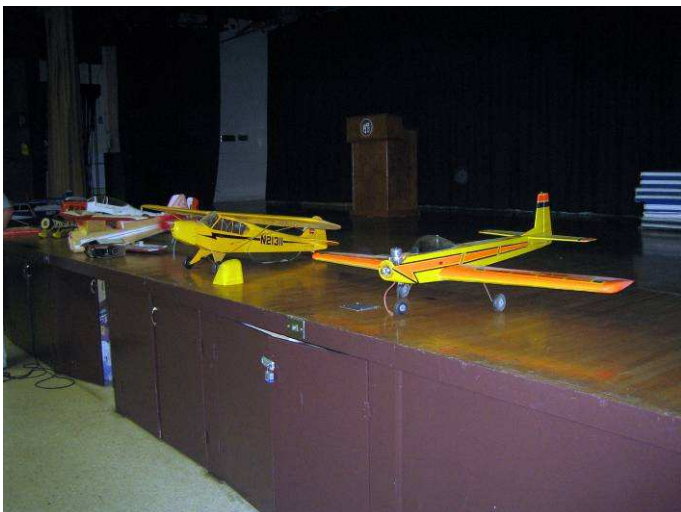
Figure 3 Foundation sale of donated planes.