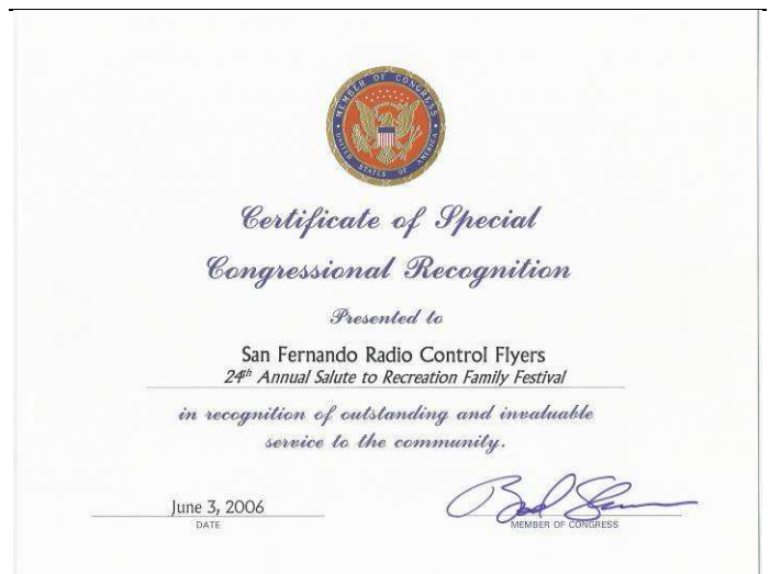
Figure 1 Signed by US Congressman Brad Sherman, serving the San Fernando Valley in Calif. 27th District

The San Fernando Radio Control Flyers were recognized for outstanding and invaluable service to the community at the 24 th Annual Salute to Recreation Family Festival, June 3, 2006