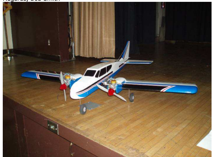
Figure 1 Is this my good side?