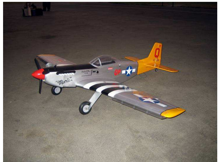
Figure 8 Night fighter in training