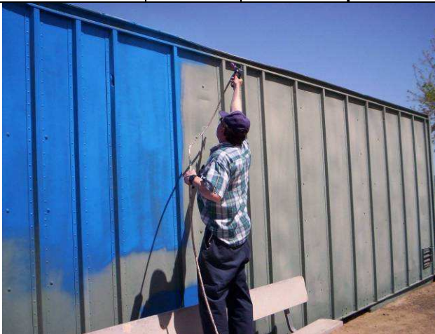
Figure 10 Paint it Blue? Paint it Gray?