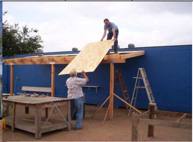
Figure 11 I knew we should have used balsa.