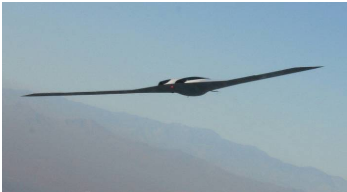
Figure 1 Lockheed Martin Polecat

Lockheed Martin reports conducting flights below 15,000 ft at the Nellis range in Nevada. Flight testing is continuing through the summer -- with the Polecat intended to reach increasingly higher altitudes, up to about 65,000 feet. You can't tell a lot from the photo -- provided by Lockheed Martin -- but the company says this is a tail-less "Horton" flying wing design -- similar to that of the B-2. The new airplane, it says, is 90 percent composite materials, rather than metal. Lockheed reports $27 million has been spent on the program -- and so far, there's just the one prototype.