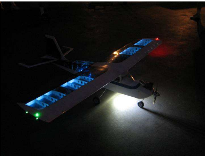
Figure 6 Jason Pakfar shows he can go slow, too.