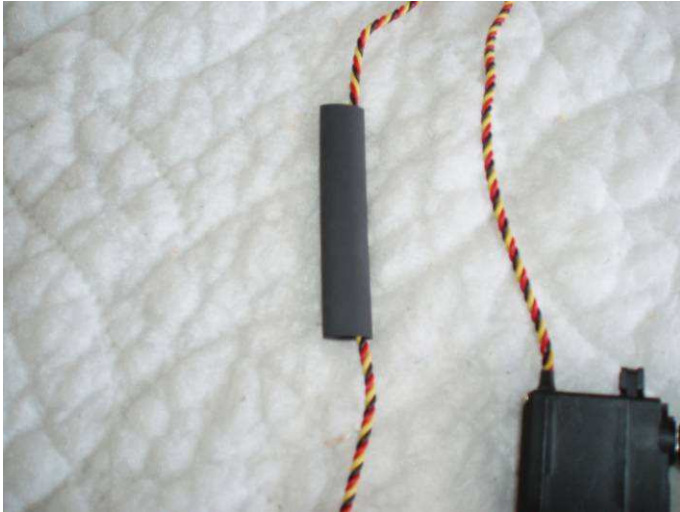
Figure 3 Heat shrink, baby!