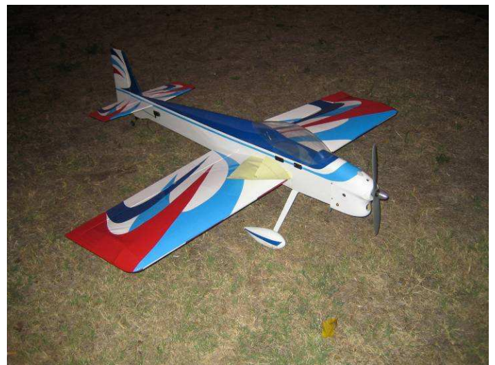
Figure 9 What am I bid?

If you missed the summer night fly, you missed something special. Weather was perfect, and there was a good crowd.