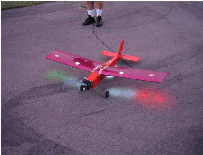
Figure 5 Bruce Schneider lit the place up, too.