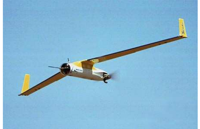
Figure 2 Boeing Scan Eagle

ScanEagle is launched autonomously via a pneumatic catapult launcher. It is retrieved using a patented "Skyhook" system in which the UAV catches a rope hanging from a 50-foot pole. The system is runway independent and can be operated from moving vehicles and ships.