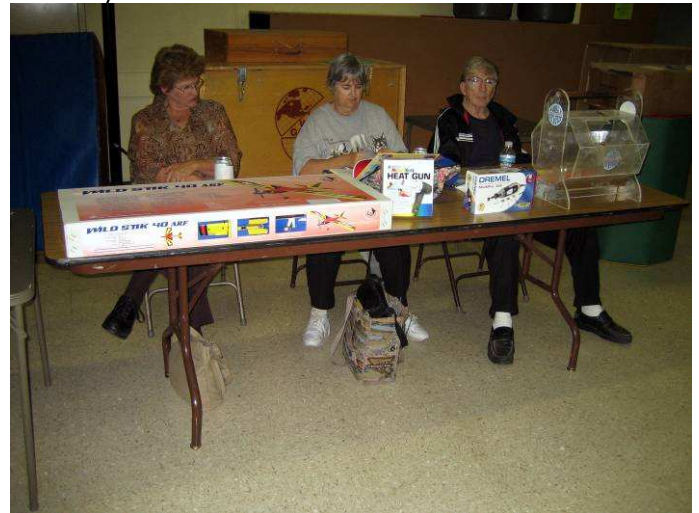
Figure 1 The Prize Table