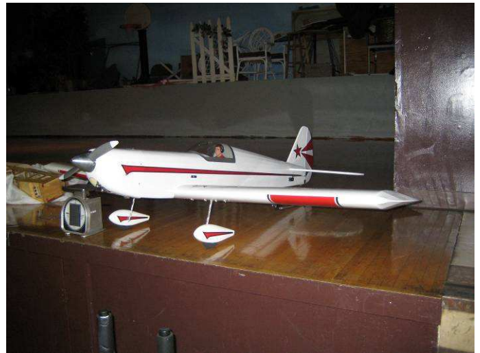
Figure 8 Super Sportster not so nakid.