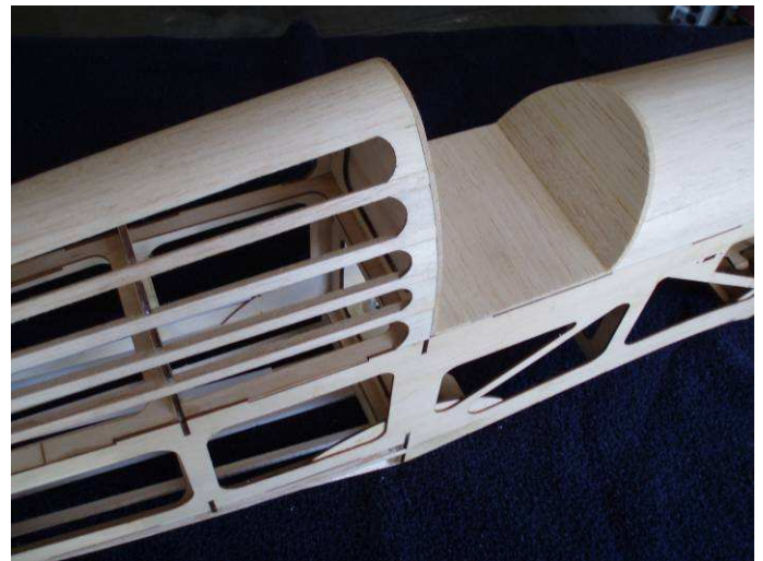
Figure 7 Super Sportster - In the buff.