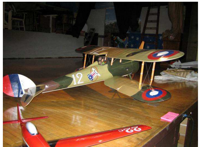
Figure 3 A nice scale Neuport