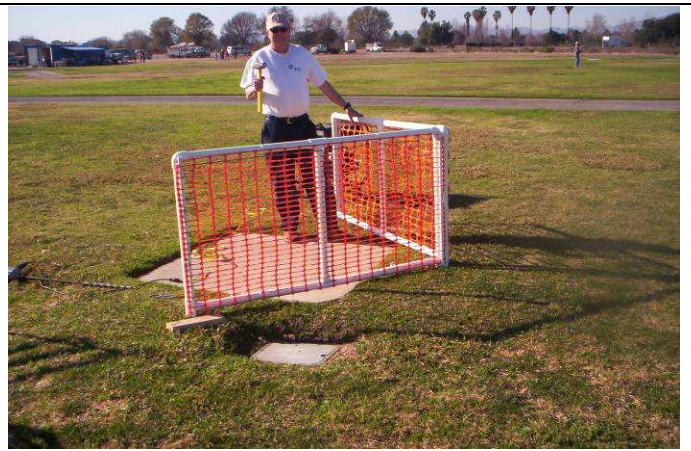
Figure 2 Dave Sweaney models the latest in Barriers