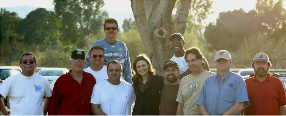
Actress Emily Deschanel - Star of Fox TV Series, Bones - Poses with the pilots at the end of the shooting day. February 5, 2007.