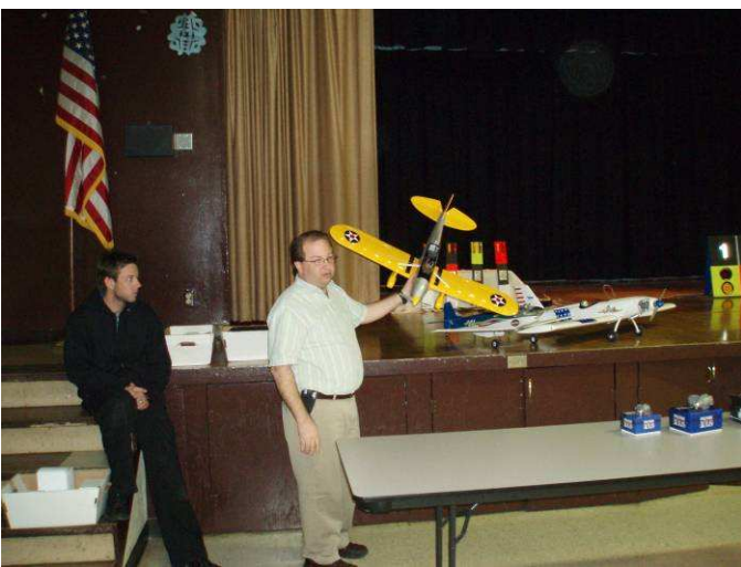
Figure 2 Hobby People's new gas or electric Ryan.