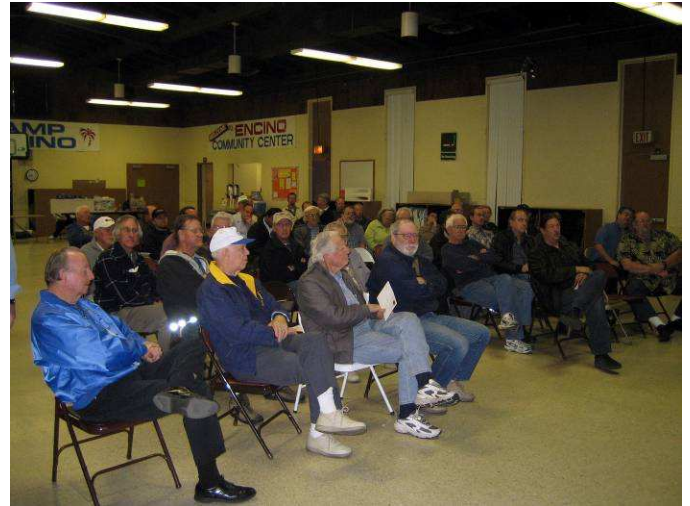
Figure 4 Working towards a full house.