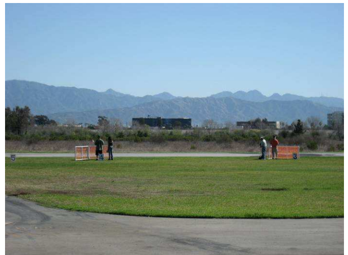
Figure 6 Safety Barriers hard at work.