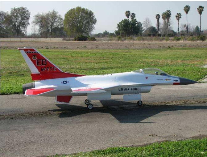
Figure 2 Gregg Fullington's latest jet.