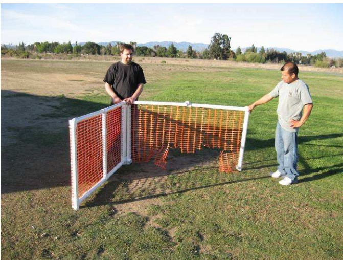
Figure 3 Why it's still a good idea to wear shoes while flying.