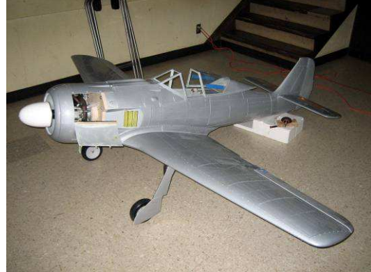
Figure 5 Billy's FW 109