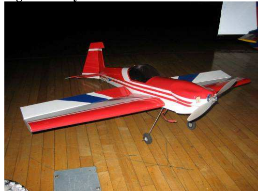
Figure 6 Is this a Super Sportster?