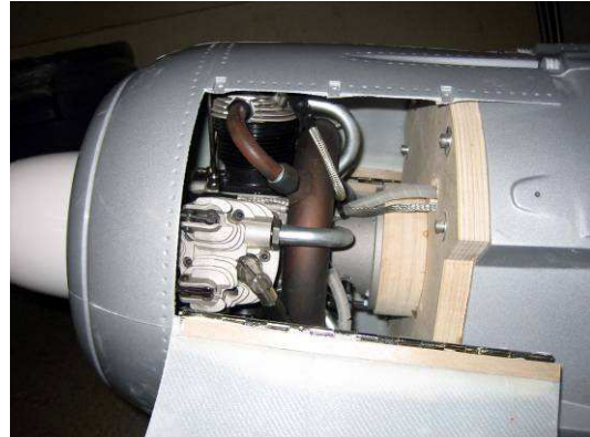
Figure 4 What makes a Giant Scale FW 190 go?