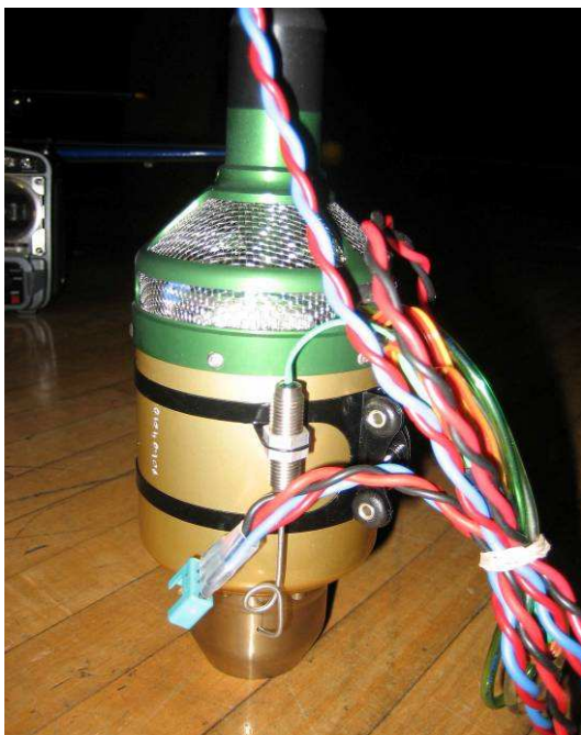
Figure 3 Is that a Wren turbine in your pocket ?