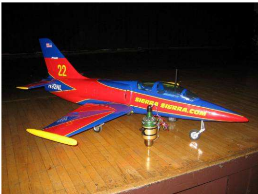
Figure 2 Pocket jet for deep pocket.