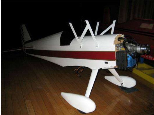
Figure 1 Guess what this is....You're right!

What you missed if you missed the May meeting