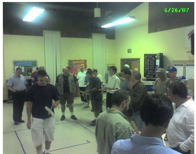
Figure 3 Skill and determination rule the day.