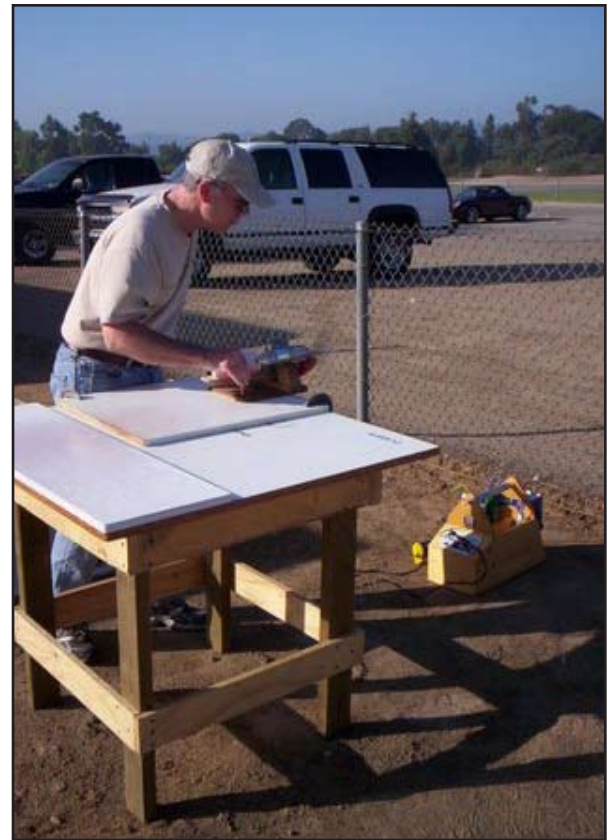
Table for "Clamp" or "Screw" down engine mounts