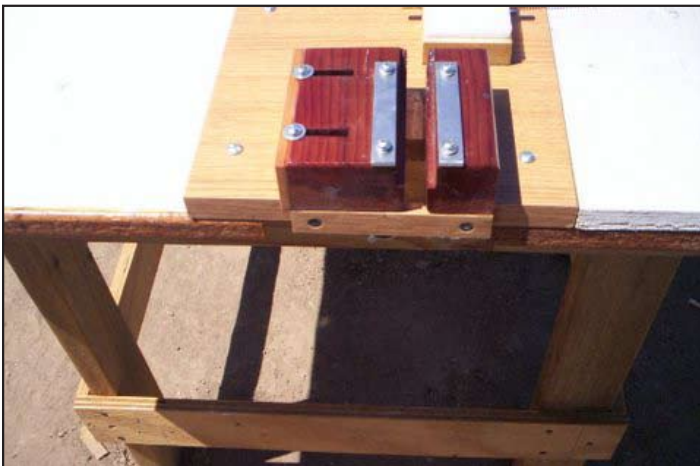
Same table for various size engines break-in

PLEASE keep tables "clean" when done using for the NEXT person.