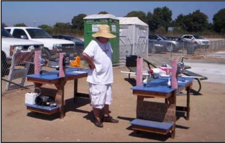
Two tables for Aircraft "Only" Engine Break-in

PLEASE keep tables "clean" when done using for the NEXT person.