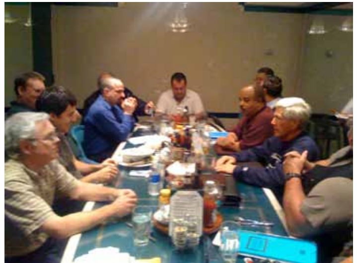
Business gets done at December's VF Board meeting.

Email: johng.info@gmail.com or call 760-560-7230 for information. You can also just show up.