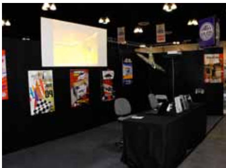
A view of this year's VF booth.

And we are already planning to make a big show at AMA Expo 2010, when the Valley Flyers will be celebrating our 60th year!