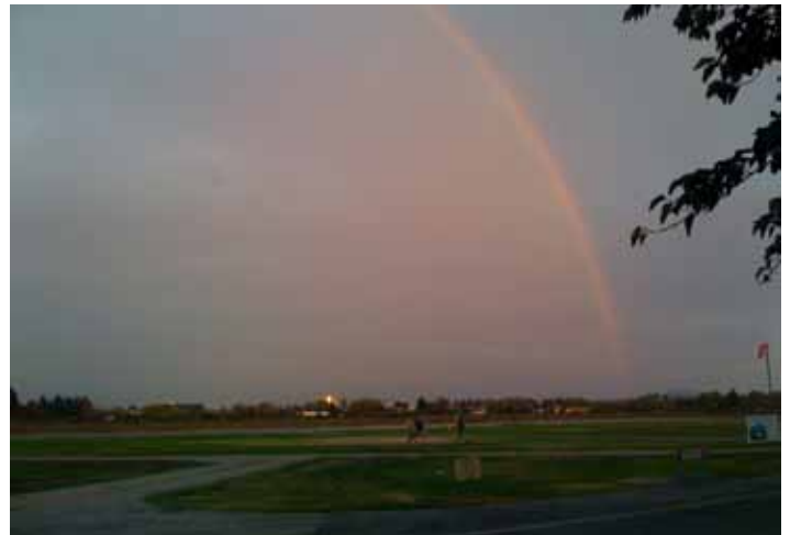
A rainbow over Apollo XI field.