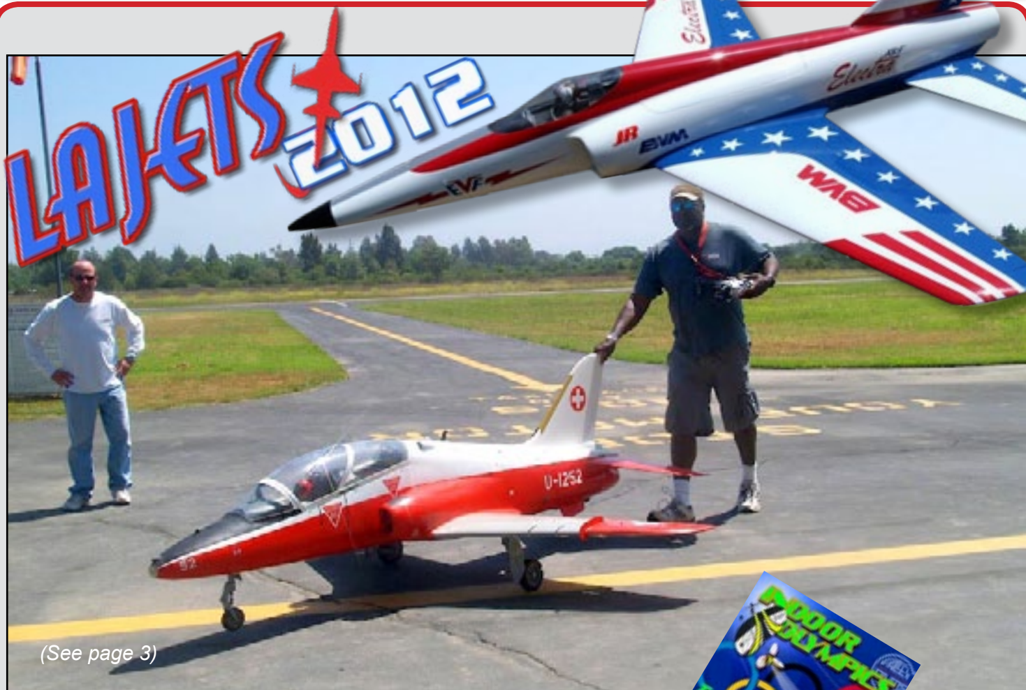
(See page 3)

Dont forget the Indoor Olympics this Tuesday May 22nd